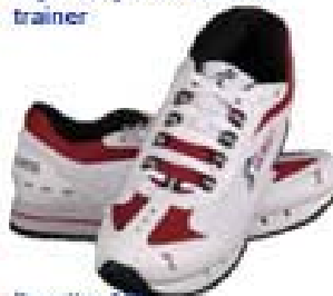
Bandito $89 Cushioned Racing