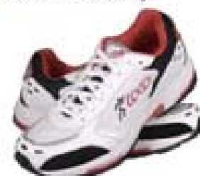
LOCO Perfecto $90 Cushioned trainer